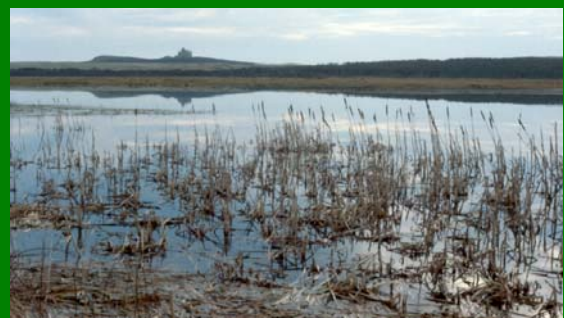
Picture 2. Bunduff Loughs by the coast