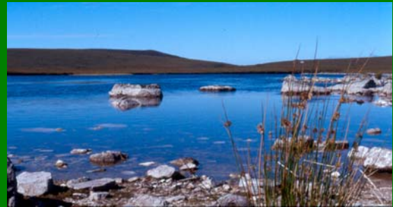
Picture 1. View of Lough Nalackagh, in the Ox Mountains

However, of the 6,000 lakes thought to be in the country, only a small minority (several hundred) are monitored on a regular basis.